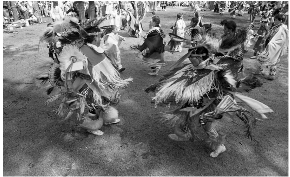
Image from the Charlotte Hawkins Brown Museum. Courtesy of the North Carolina State Historic Sites.